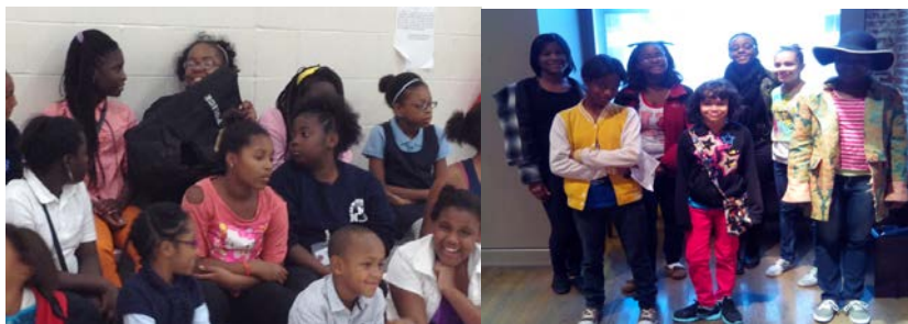
Speaker Time and Boys 2 Men and Halo field trip to Frazier Museum